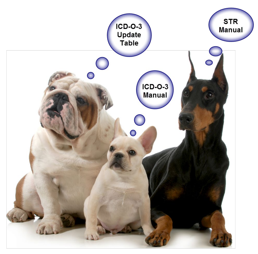
It takes three to code histology these days!

Coding Drills for Dx Year 2018 Histologies Released October 14, 2019